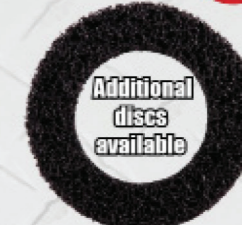
ET4070D - 5 pack