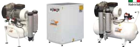
DENTAL / MEDICAL SERIES

AIR COMMAND's range of dental compressors are purpose designed and built in Italy for the medical and dental industry and incorporate a unique oil-free compressor pump which eliminates the risk of oil particle and vapour contamination in the air supply.