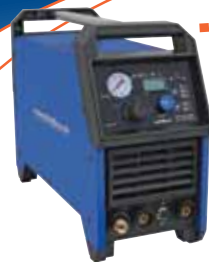
#WT4015MP Multi Process Welder