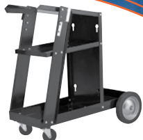
#WT115 Welding Trolley