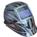
#DW3000 Welding Helmet