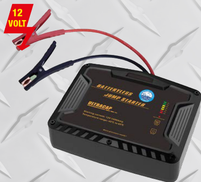
ETUC12V800 800A Peak CCA