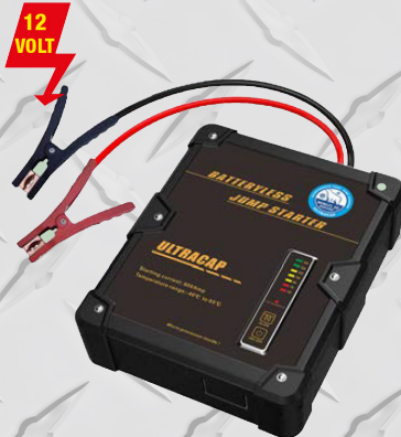
ETUC12V1500 1600A Peak CCA