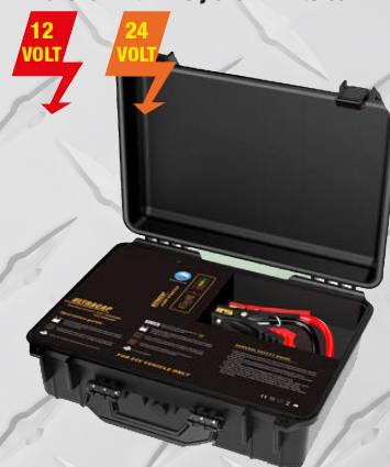
ETUC1224v 1000A/ 16,00A Peak CCA