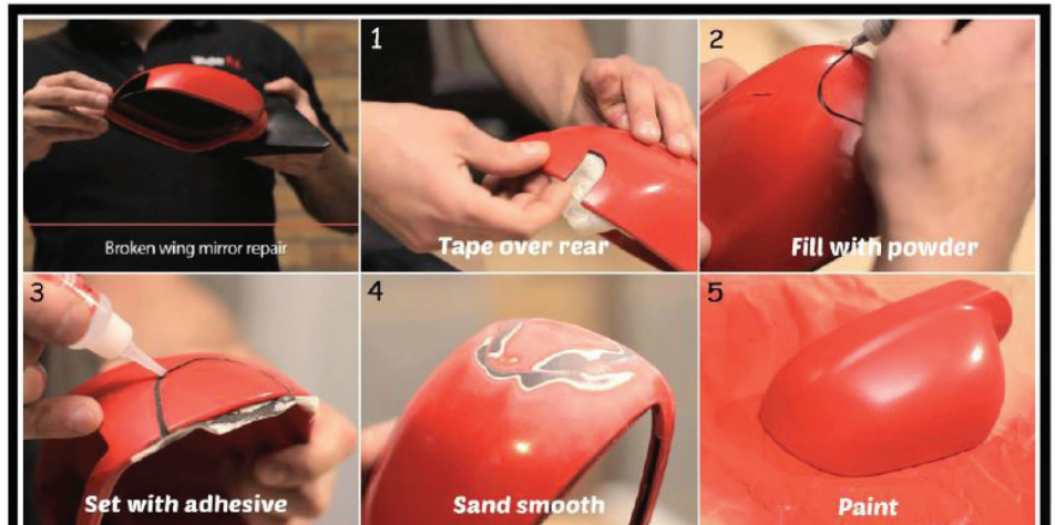
Broken wing mirror repair