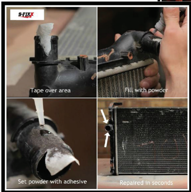
Tape over area