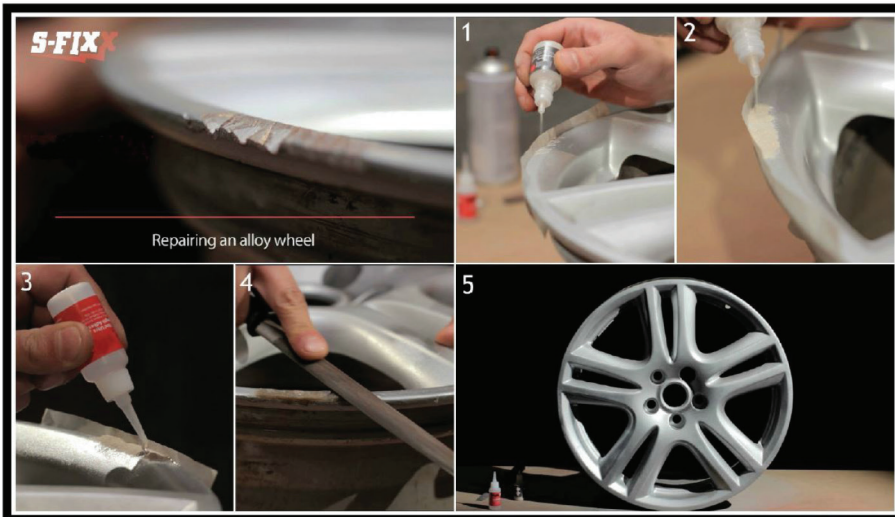
Repairing an alloy wheel

Save time... Don't wait hours for glue to dry ...Supafix cures in just seven seconds.