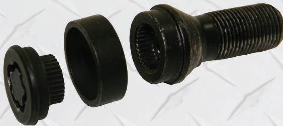
Breakdown of a BMW spinning lock ring bolt.