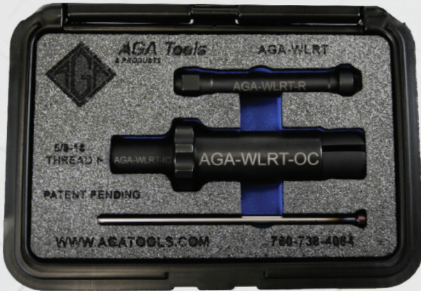
The AGA BMW Wheel Lock Removal Tool